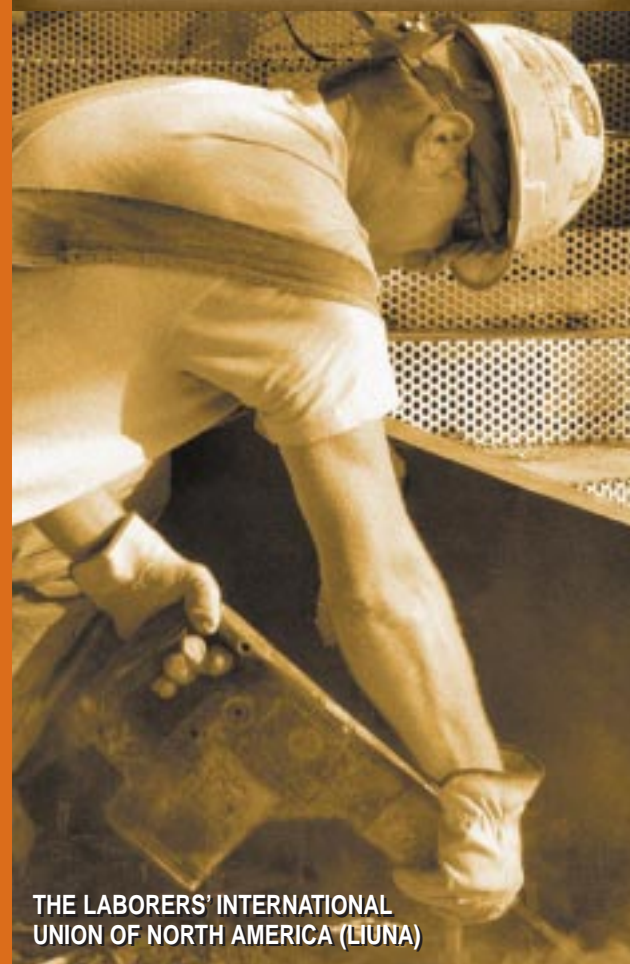
THE LABORERS' INTERNATIONAL UNION OF NORTH AMERICA (LIUNA)